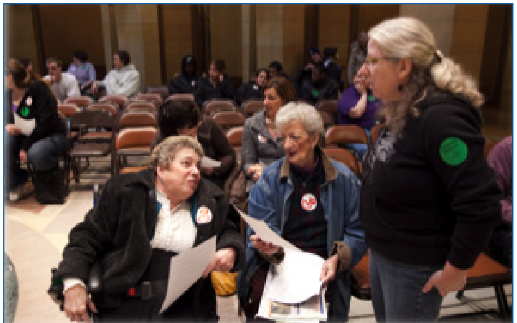
MSCOD staff and council members partake in Advocacy Day at the Capitol

Much progress has been made on removing barriers for people with disabilities. Despite that progress, we continue to live in a Minnesota that has barriers for people with disabilities. People with disabilities continue to experience disparity with lack of adequate accessible transportation, housing, as well as physical and