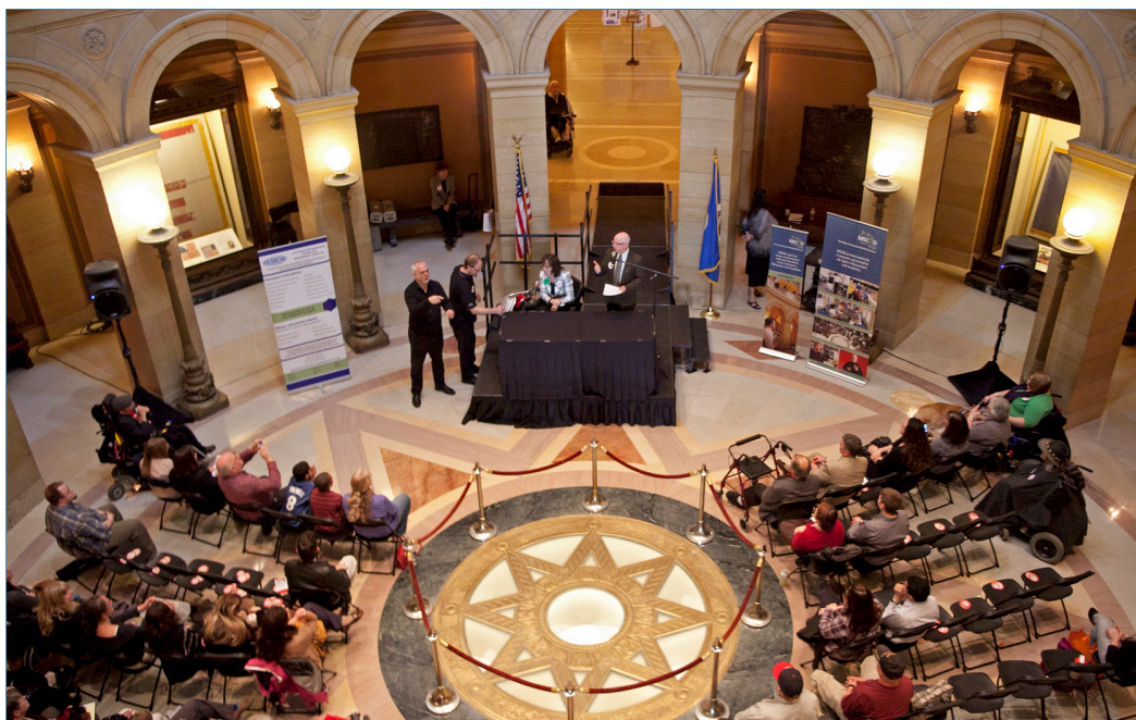
MSCOD held its annual Advocacy Day at the Capitol in March, 2012.

As the 2013 legislative session begins with a large number of new house and senate members, MSCOD is gearing up to work collaboratively with our partners and other state agencies to empower and strengthen the rights of Minnesotans with disabilities.