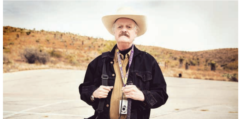
George Covington, Photographer Courtesy of The Alcalde Photo by Anna Donlan