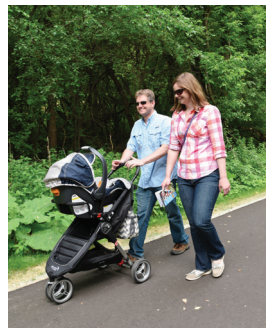
Accessible, paved trails