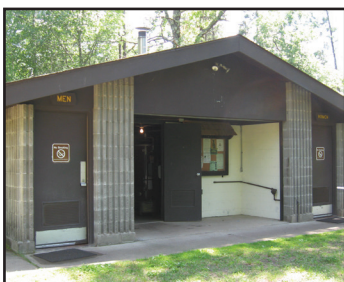
Narrow doorways prohibit wheelchairs from entering restroom facilities.