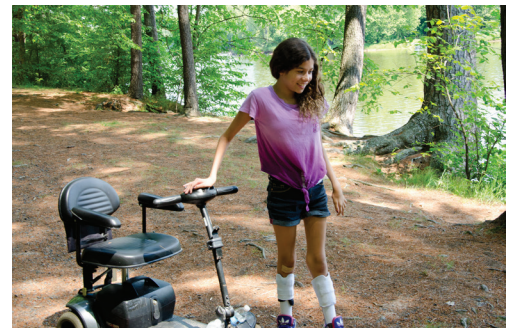
Accessible, unpaved trails