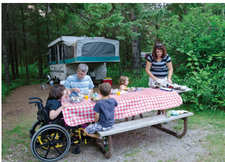
Wheelchair accessible picnic tables