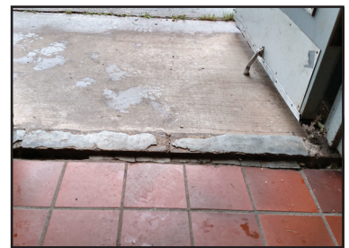
Raised thresholds in older buildings don't meet ADA standards.